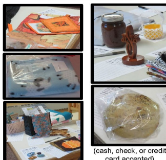
(cash, check, or credit card accepted)