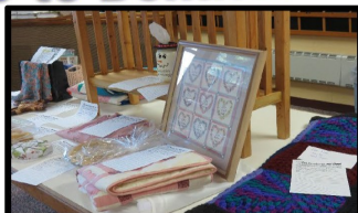
Come prepared to bid on items in the auction too!

As one of the Historic Peace Churches, we are committed to teaching Christ's message of peace – peace within ourselves as we make our peace with Jesus; peace within our families, our congregations, and with our friends; peace in our communities; and peace in the world with our friends and those we may call enemy. The Peace Endowment Fund was established in 1982 to support efforts in the District to teach the things that make for peace!