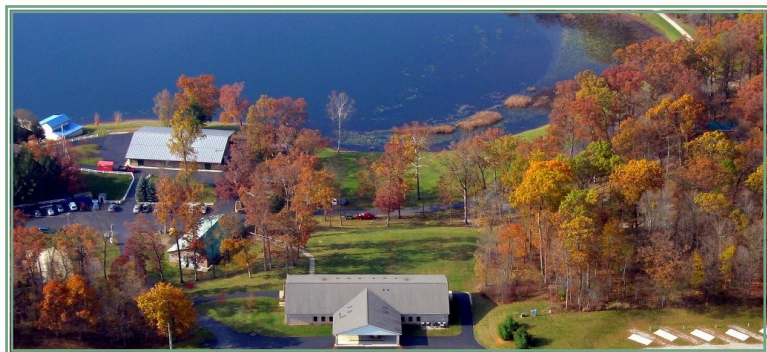
Round Lake Christian Assembly