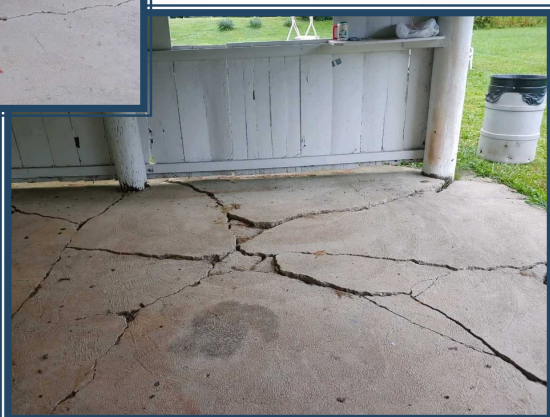
Pictured below: The newly poured cement foundation in the pavilion at Center Church of the Brethren in Louisville, Ohio.