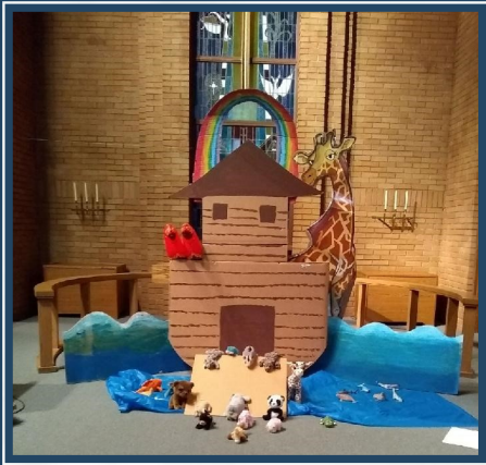
Noah's Ark Display for VBS at Painesville CoB