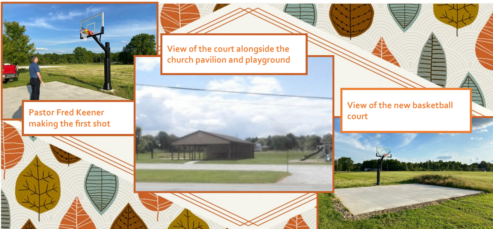
Pastor Fred Keener making the first shot

Over the years, our church has continued to grow and upgrade the property we own across the road from our church. We built a pavilion in 2013 and then installed a playground in 2017. The Hoop Group decided to install the cement pad basketball court and hoop near our pavilion and playground. We submitted a request for a Hottle Grant of $4,000