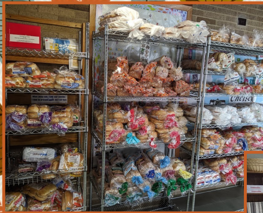
Racks of bread that has been donated by local stores and bakeries.