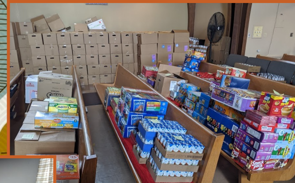
Lunch sack supplies fill the sanctuary pews. Against the wall, pre-packed boxes from the Greater Cleveland Food Bank await distribution during open pantry.