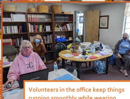
Volunteers in the office keep things running smoothly while wearing masks and maintaining distance.