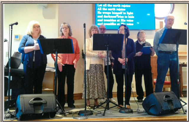
Black River CoB Praise Team singing “How Great is Our God”

Thru the generosity of our members and thru holding “spaghetti” & “soup & sandwich” fund raising dinners during the year we were able to match the $5,000.00 granted from the district board and Hottle fund. Our surrounding community, friends and family of our congregation attend these dinners regularly.