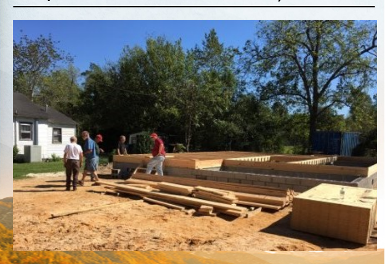
Mullen, SC Job Site October 2018