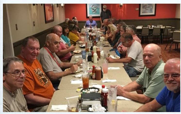
October 2018 BDM Team Welcome Dinner—Northern Ohio, Southern Ohio and Southern Pennsylvania