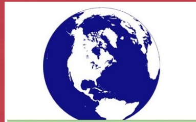
Mission News and Updates

In an effort to help churches keep up to date we will be sharing Church of the Brethren key mission updates. As workcamps/meetings have been cancelled or postponed