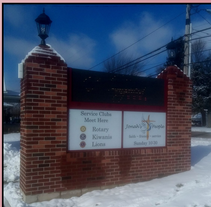
Jonah's People Fellowship Sign at Good Shepherd Home

since this event. There are still challenges with this issue. The consensus was that building the membership along with ongoing stewardship education would address the challenges.