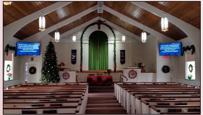
Mansfield First Church of the Brethren Sanctuary with new A/V Equipment

14 cents per mile driven in service of charitable organizations (currently fixed by Congress)