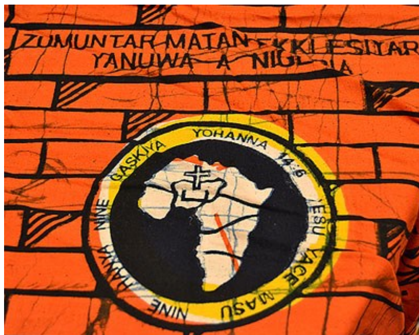
(This is a cloth worn by the ZME women's group of the Church of the Brethren in Nigeria)

The two groups coming are from Ekklesiyar Yan'uwa a Nigeria (EYN, the Church of the Brethren in Nigeria): the Brethren Evangelism Support Trust (BEST), a group of business people and professionals; and an EYN Women's Fellowship Choir.