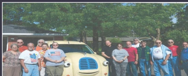
Disaster Ministries Trip May-June 2016 Detroit, MI