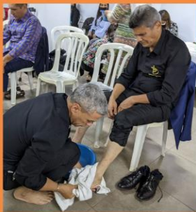
FOOT WASHING VENEZUELA COB -GLOBAL MISSION STAFF

Praise God for the recent Annual Conference and the faithfulness of the church. The conference theme was "Expansion". The Venezuelan Brethren are evangelists. The Venezuelan church has reached neighboring Columbia along with Venezuelan refugees. Pray for indigenous Brethren in Venezuela. The economic situation is dire. Monthly salaries are worth a few dollars but cost of living is around $400 a month.