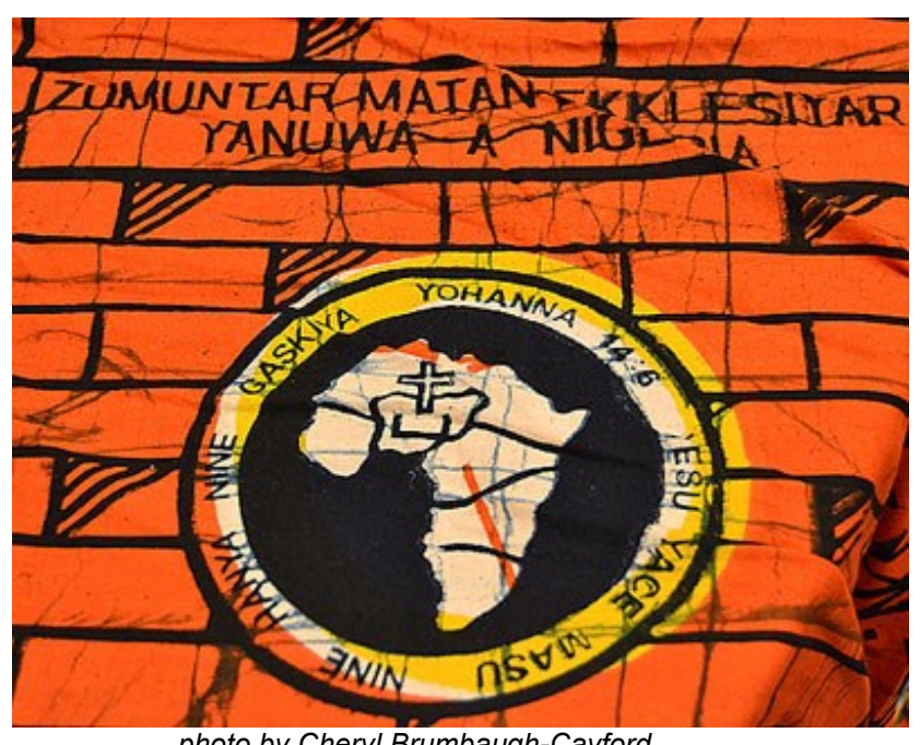
(This is a cloth worn by the ZME women's group of the Church of the Brethren in Nigeria)

Meet Brothers and Sisters from the Nigerian Church. Hear their stories. Listen to the Women's Choir. Enjoy Christian fellowship together.